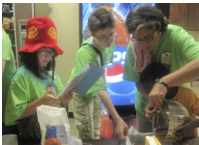
Figure 1. ScienceKit in Kitchen Chemistry. The mobile app is situated in the cooking and science activities.

Specifically, we are focusing on the design of ScienceKit to help learners engage in science inquiry practices across school, home, afterschool, and other learning environments (Figure 1) [6]. ScienceKit will support specific inquiry practices such as developing questions and hypotheses, building investigations, making arguments, and using integrated and social media to capture and record data. CI is an important design approach in our efforts to develop technology that children are motivated to use across different settings. In the future, we envision children using ScienceKit in Kitchen Chemistry , an afterschool or summer camp program that supports the development of scientific inquiry skills through hands-on learning activities, such as making and perfecting dishes. The use of ScienceKit is therefore tied to the contextual activities of cooking and investigation development.