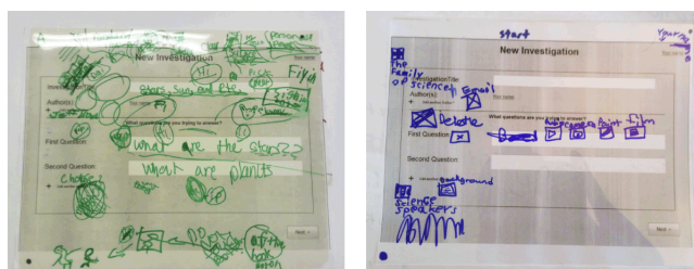
Figure 6. Kidsteam (left) and KC (right) example panel.

Multiple interactions: Panel (2) prompted learners to design ways to input temperature. KC children only wrote one idea, that is, to change between the temperature units. Kidsteam co-designers greatly emphasized the interaction. For instance, we counted eight different ideas just for a thermometer, including color as a way to tell temperature, a hypothesis section just for temperature, and the ability to drag temperatures onto a picture for labeling.