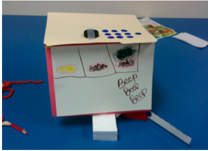
Figure 2. A sample low-tech prototype from “Bags of Stuff”.

on top of the prototype and used permanent markers to draw their ideas on the transparency. After a specified amount of time, the teams met together briefly to present their designs while an adult recorded the “big ideas.” Then another transparency layer was added on top of previous ideas and the clipboards were exchanged with another team. In the next round, children continued to add more designs onto their transparency.