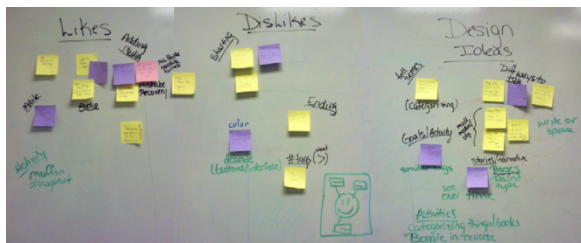
Figure 3. An example of “Sticky Notes” co-design technique.